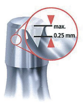
Mild scratches (less than 0.25 mm in width)